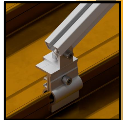
Integration with angled system