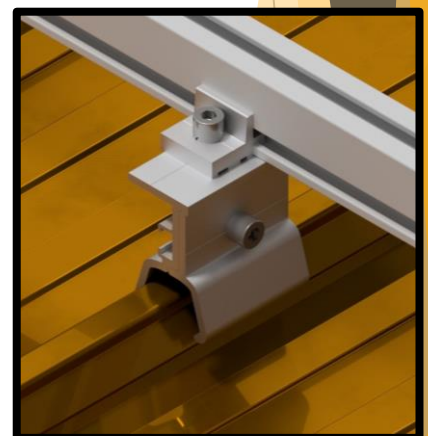
Integration with Railed system connection