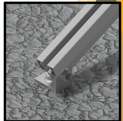
Integration with angled system