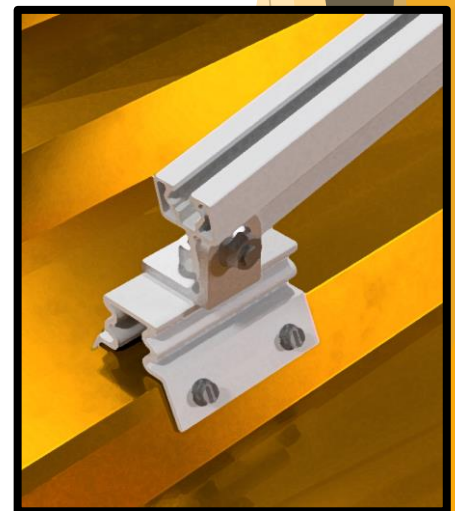
Integration with angled system