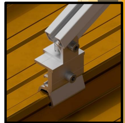
Integration with angled system