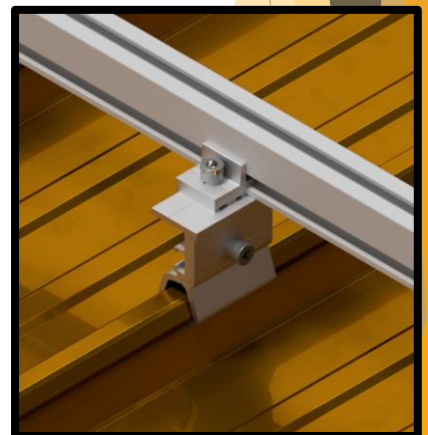
Integration with Railed system connection