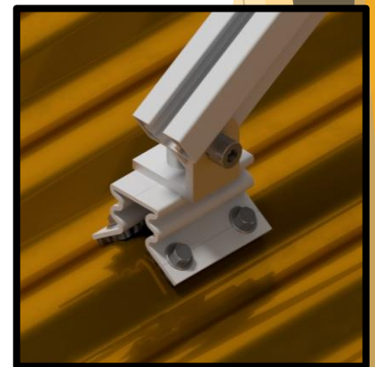
Integration with angled system